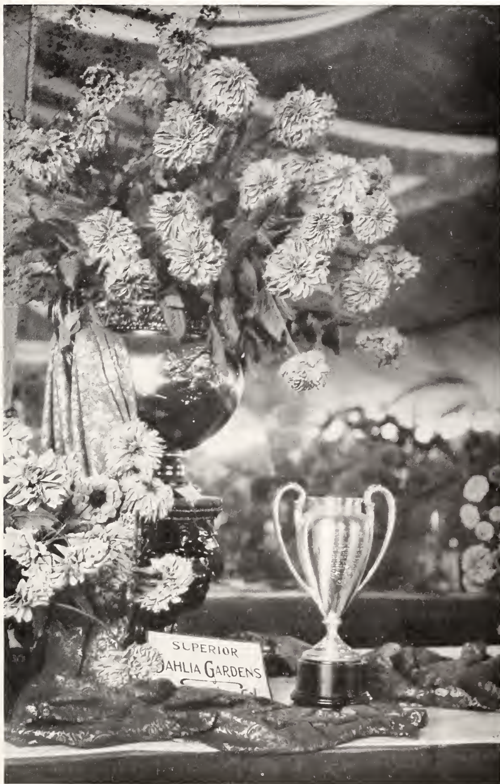
Vase of 50 Winning Butterfly Dahlias at leading show of Southern California, 1927. Height of display was five feet.